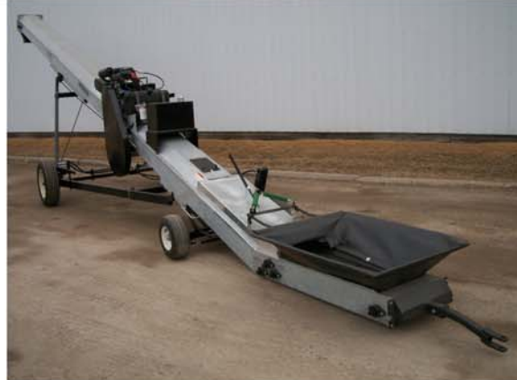
Optional Hydraulic Drive Wheel Kit