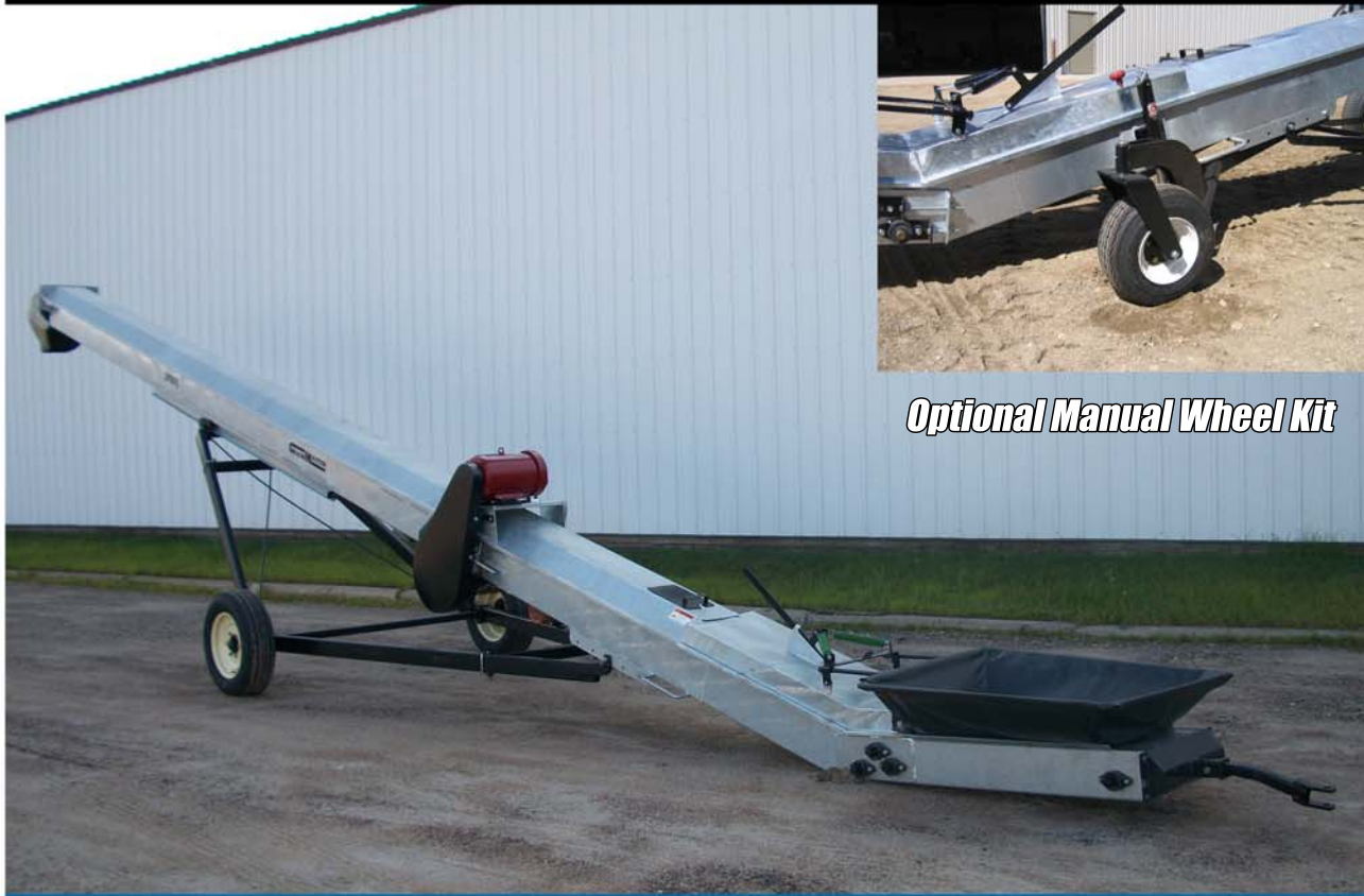
Optional Manual Wheel Kit